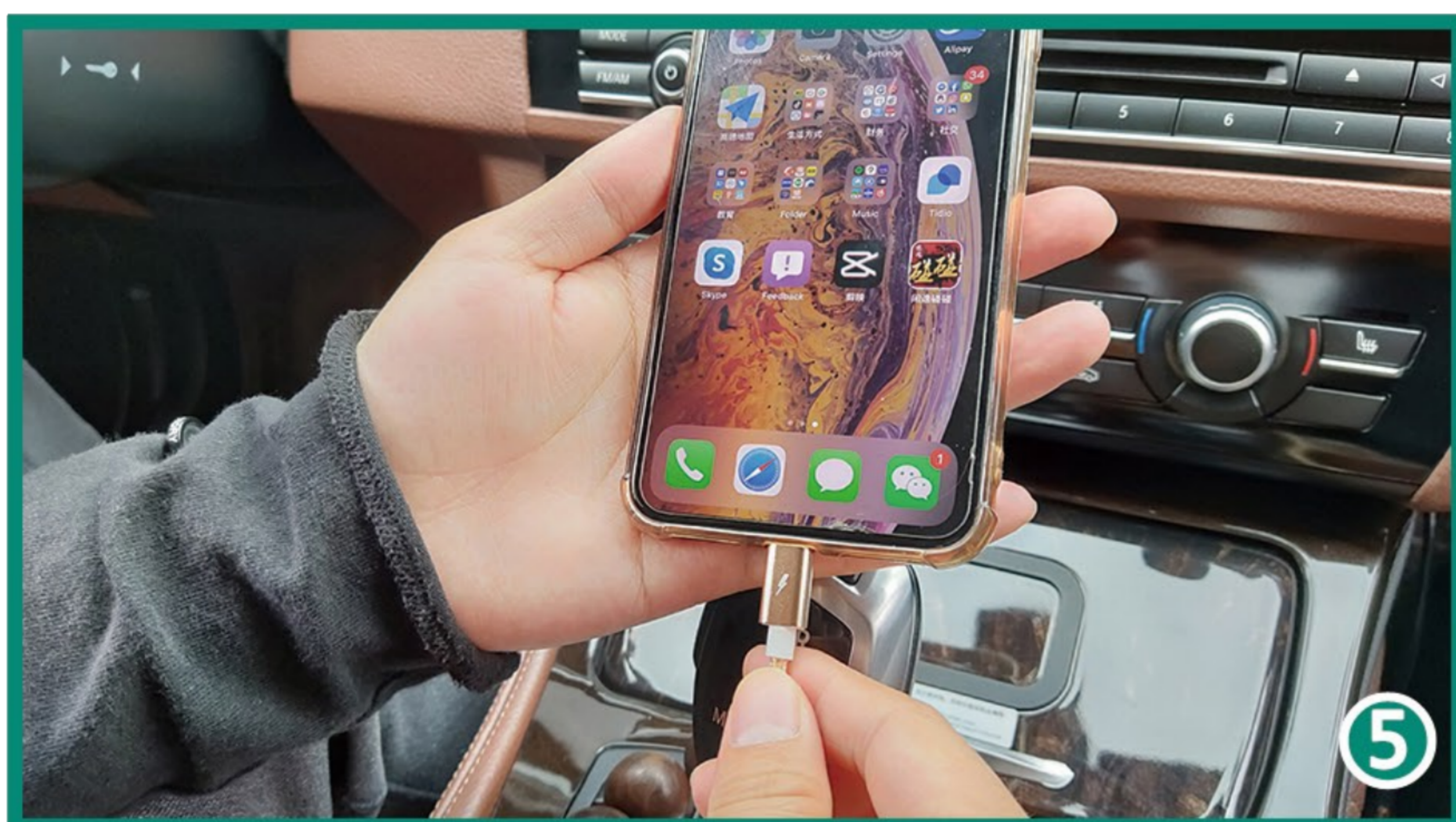
5, Then connect with iPhone.