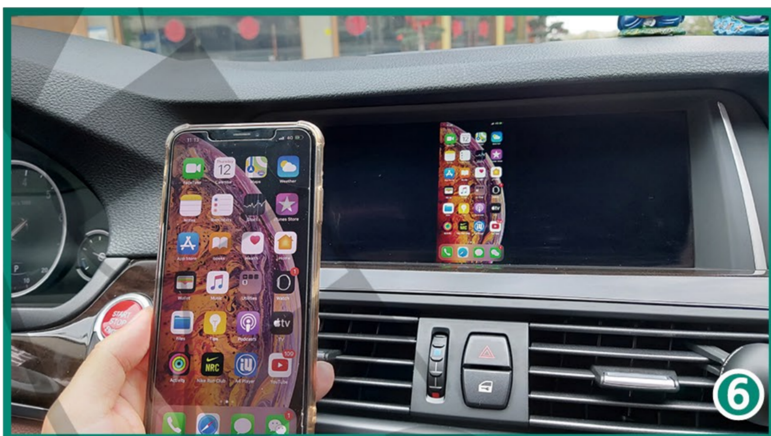
6, iPhone will get trust request. click Trust, Then all job done, Enjoying..