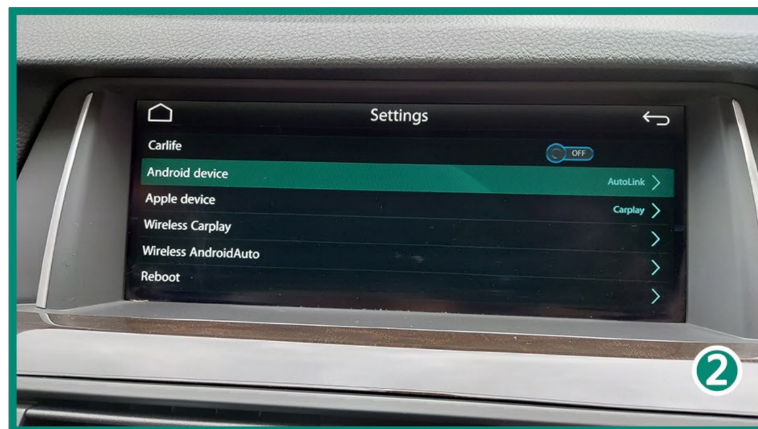
2, Apple device.