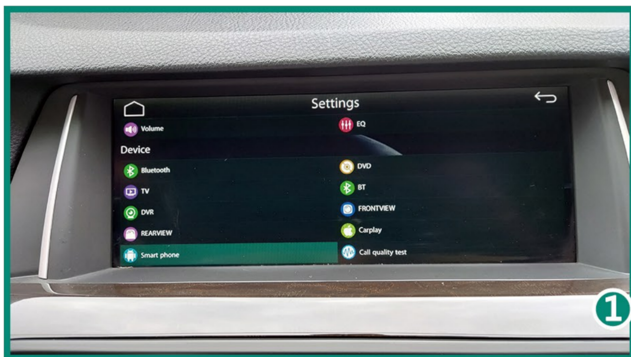
1, Go to setup, select Smart phone.