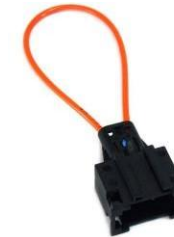
Fig. 01 F.O. loop connector